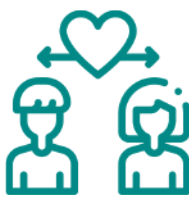
SAFE EVENT PROGRAMS