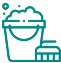
EXTENSIVE CLEAN SERVICE

The Baron’s Residence COVID-19 Support Services are specialized: