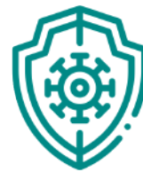
MEASURES SAFETY +