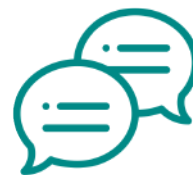
INFORMATION ABOUT THE BEST PRACTICES